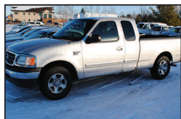
2003 FORD F-150 XLT Extended cab, great price on this truck. AS LOW AS $199 A MONTH