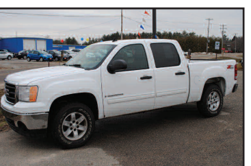
2009 GMC SIERRA SLE Z-71 4x4, tow pkg, bedliner, crew cab. AS LOW AS $199 A MONTH