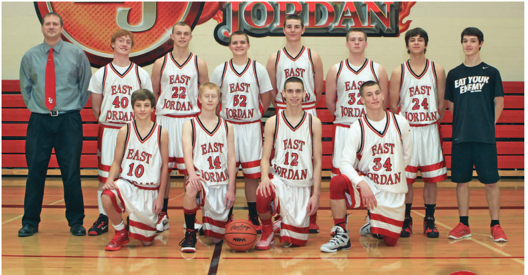
East Jordan has been off since before the holiday break and with that extended time to prepare the Red Devils have used that chance to get healthy (sickness) and get everyone at practice. East Jordan returns to action on January 16 when they travel to Traverse City St. Francis to face the Gladiators.