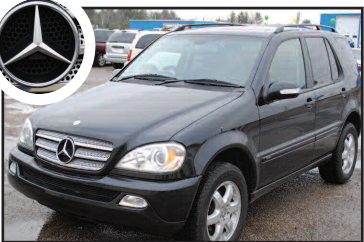
2004 MERCEDES ML 350 AWD, leather, heated seats, power moonroof. Only 91 K. SALE PRICE $9,999.