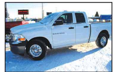
2011 DODGE RAM 1500 CREW CAB Seats 5. Great truck. AS LOW AS $199 A MONTH