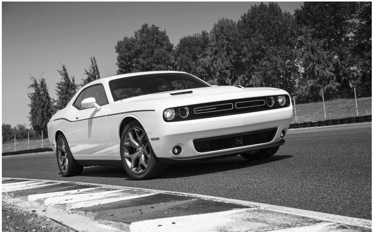
The all-new 2015 Dodge Challenger has earned a five-star overall safety rating from the U.S. National Highway Traffic Safety Administration (NHTSA).