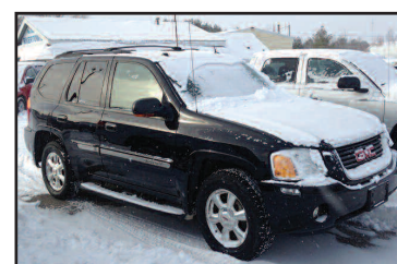
2005 GMC ENVOY. 4WD, leather, loaded. AS LOW AS $199 A MONTH