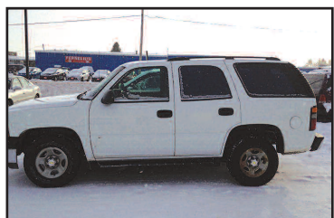
2004 CHEVY TAHOE 4x4, 3rd row seat. Great for a family winter driving. AS LOW AS $199 A MONTH