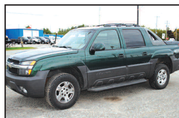
2003 CHEVY AVALANCHE Z-71 4x4, leather, tow pkg, bedliner, cover. AS LOW AS $199 A MONTH