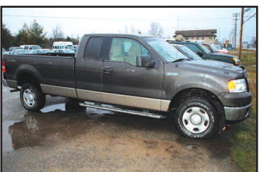
2006 FORD F-150 4x4, bedliner, tow pkg, 5.4 Triton, Club cab, seats 6. AS LOW AS $199 A MONTH