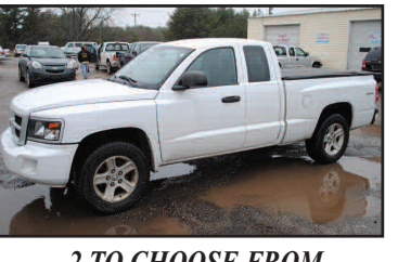
2 TO CHOOSE FROM. 2010 DODGE DAKOTA Big Horn Edition. 4x4, tonneau cover. AS LOW AS $199 A MONTH