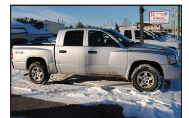
2 TO CHOOSE FROM. 2006 DODGE DAKOTAS Crew Cab, seats 5. 4x4. Nice trucks. AS LOW AS $199 A MONTH