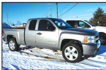
2008 CHEVY SILVERADO LT 4x4, 20 inch wheels, ext cab, soft tonneau cover, tow pkg, bedliner. AS LOW AS $199 A MONTH