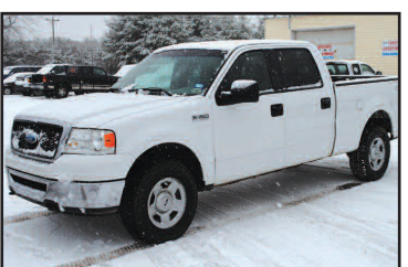
2008 FORD F-150 XLT 4WD, ext cab, bedliner, 4 door. SALE PRICE $8,500