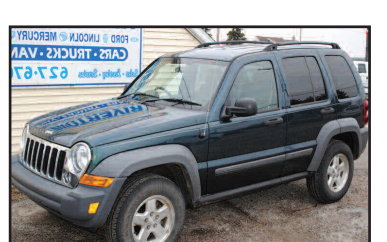
2005 JEEP LIBERTY Hard to find DIESEL. 4WD, tow pkg, 115 K. SALE PRICE $9,995.

989 VFW RD., CHEBOYGAN, MI • 231-627-6700 • WWW.RIVERAUTO.NET